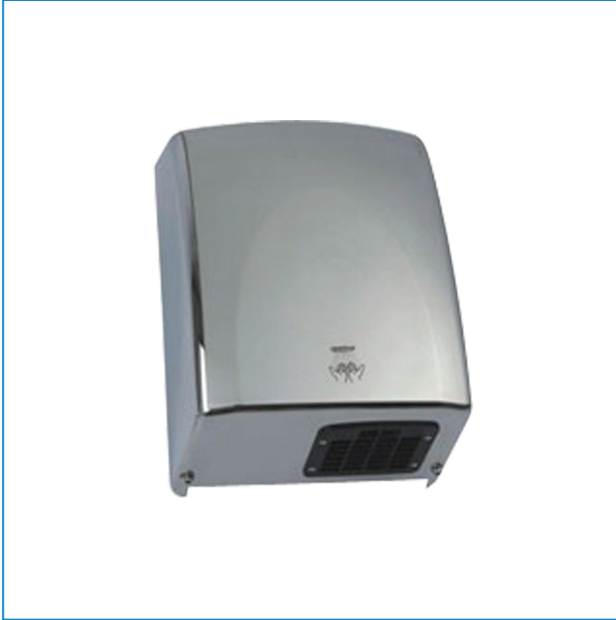
Automatic Hand Dryer