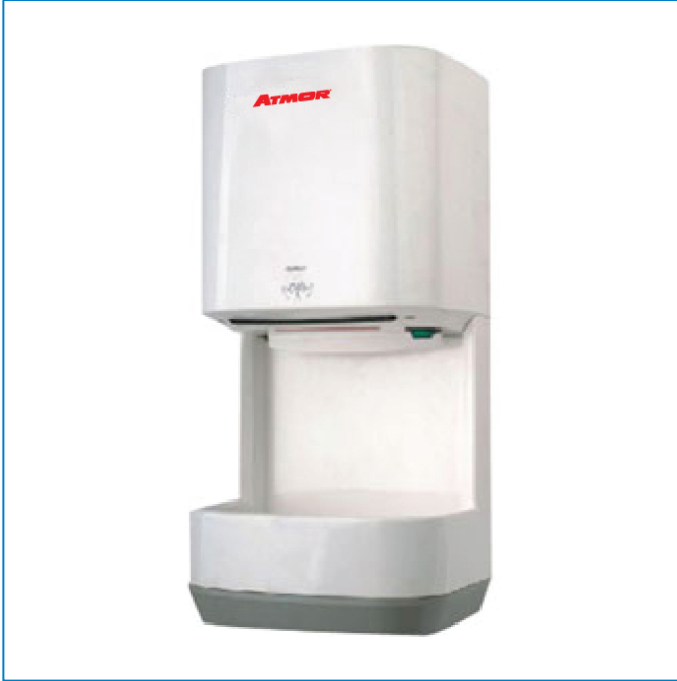
Automatic Hand Dryer