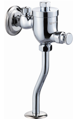
Urinal Flush Valve Model: 90013